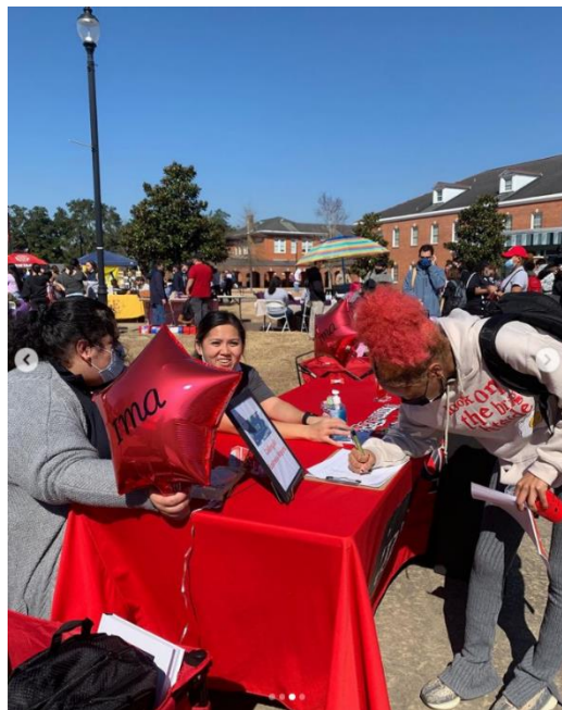
Photo of potential member signing up for IMA

As mentioned above, IMA taken part in as many campus events as possible to promote IMA to all business majors. We utilized monitors in our accounting building and hang flyers in all the business buildings. We took part in Get on Board Day and meet potential members. As well as hold our Registration Drive and obtained more members after that. What also helped was the “Refer a Friend” event point we shared with new members after they joined. A combination of all these things mentioned in the submission help achieve this result. When we began this Spring semester, we only had four members. We tripled that number into 12 members. It’s not the number we were hoping for, but it is still an accomplishment. This wouldn’t have happened without the teamwork of all the officers.