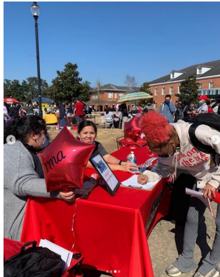
Photo taken at Get on Board Day

Our second objective was to be a part of Get on Board Day. It's a day where all UL's Lafayette organizations join together on the Quad and set up promotional booths and tables for their respective organizations. Our President trained all the officers about table etiquette at an event and how to pitch IMA to potential members. We came up with an idea to bring two red balloons to make our table stand out from others and put "IMA" on both sides of the balloons.